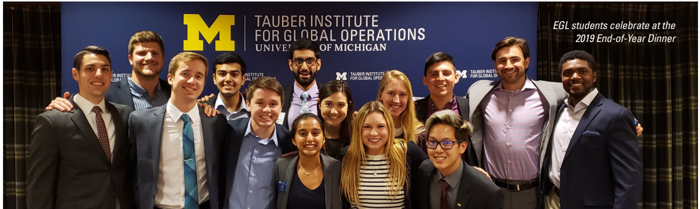
EGL students celebrate at the 2019 End-of-Year Dinner

Q: What value can the Tauber Institute for Global Operations bring to an engineering student? What are the benefits of obtaining a graduate engineering degree with the Tauber overlay?