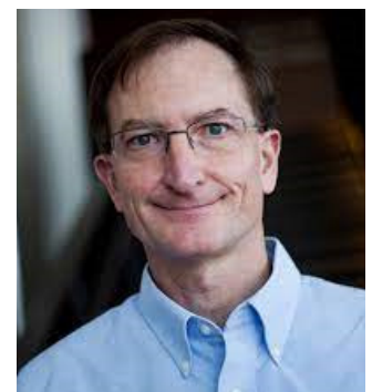
Dr. Fred Terry College of Engineering